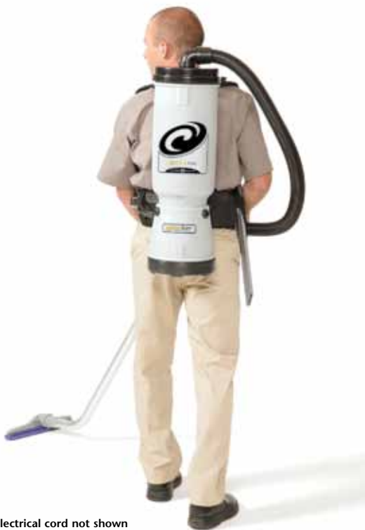
Electrical cord not shown

*see owner's manual for complete warranty details