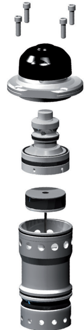
The 245 Power Engine